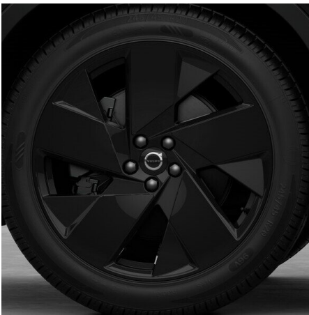
20" 5 Spoke Std Black Edition