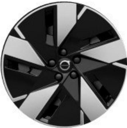
19" 5 Spoke (Std Plus)